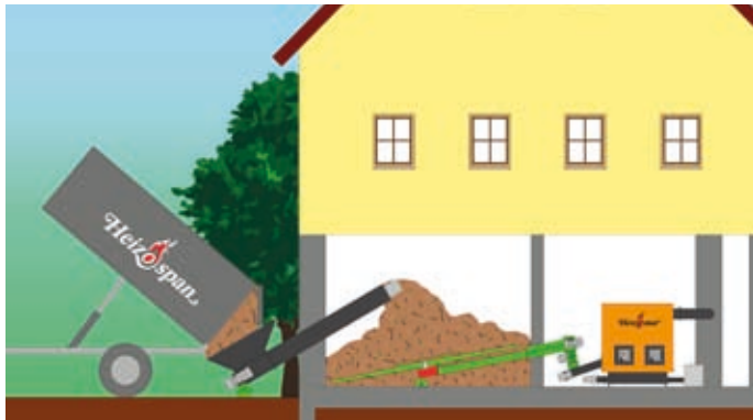
Mounting directly to building