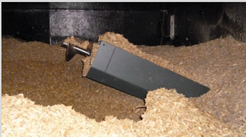
maximum inclination of the auger 45°