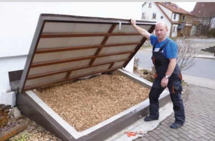
A customer in front of his filling trough